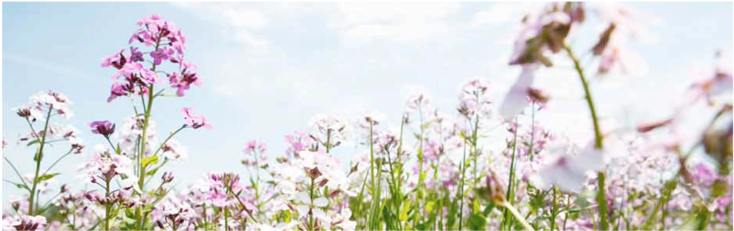
Bloomers Park - Rochester

Oakland County Features Innovation & Job News In the News Development News Sign Up About Us Contact Us