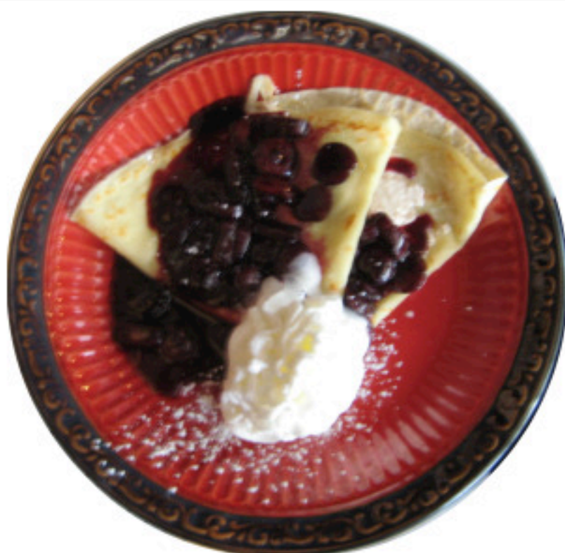
Cherries Jubilee Crepe at What Crepe?