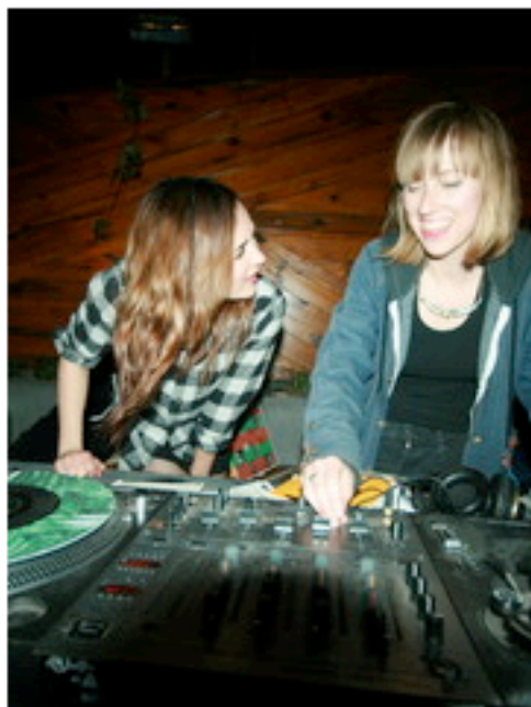
The Del Hoppettes supply the Philly Freeze every other Thursday at Slows.