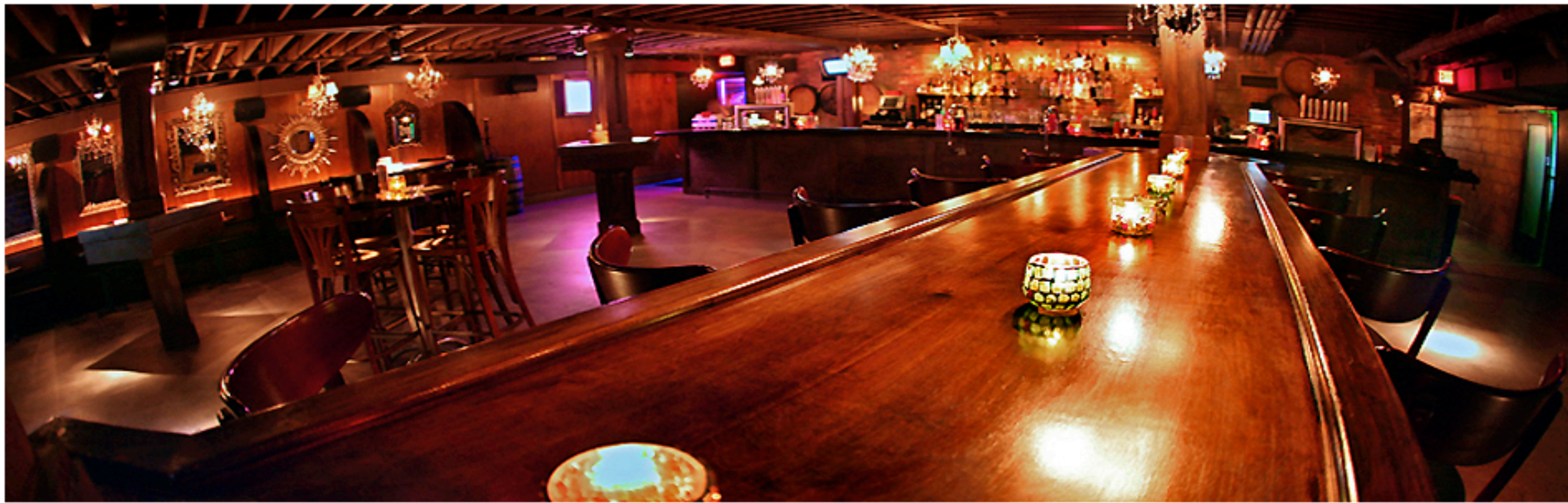
Commune Lounge at Royal Oak's Bastone, currently hosting annual Oktoberfest |