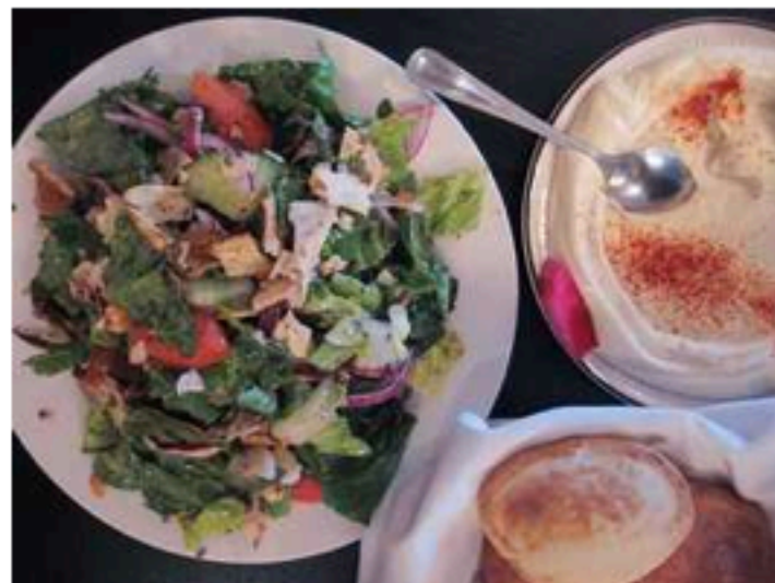
Fattoush salad, hummus and pita bread at La Feast in Livonia.

The Bastone complex is at the corner of Fifth and Main; call 248-544-6250.