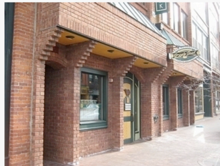
Grizzly Peak (Publicity Works PR)